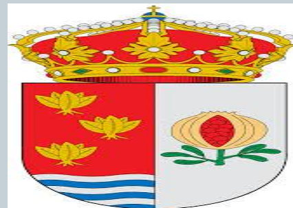
Las Vegas shield