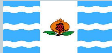
Las Vegas flag